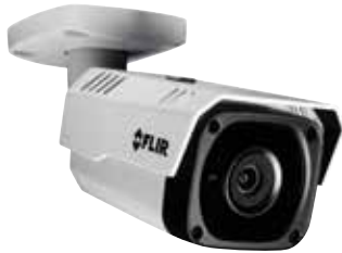
N243BW2/N243BW4 Fixed IP Bullet Cameras

Available in 2.1MP HD & 4MP QUAD HD configurations, the FLIR WDR Fixed Bullet IP cameras offer exceptional performance, providing brilliant image clarity and an incredible level of detail in recordings. True WDR capability up to 100dB ensures excellent image quality around-the-clock. Suitable for both indoor and outdoor installations (IP66 rated) and cold climates [-22°F/-30°C].